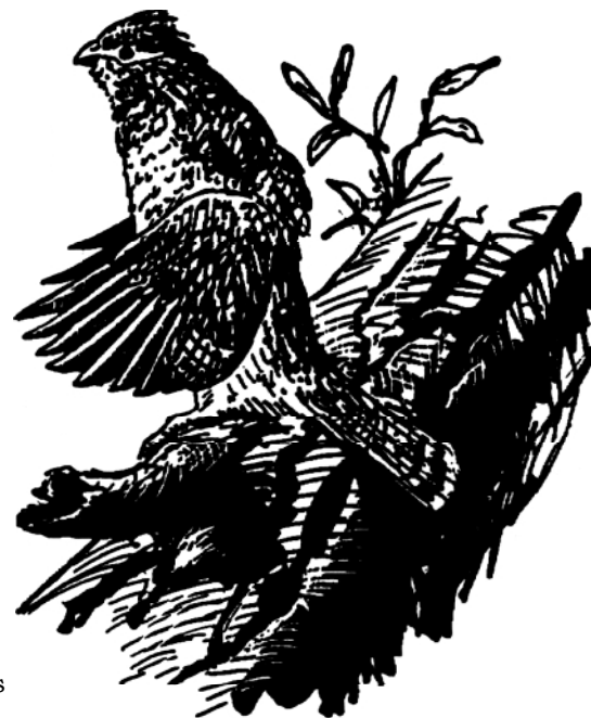
Ruffed Grouse drumming

Both gray and brownish color phases may occur in the